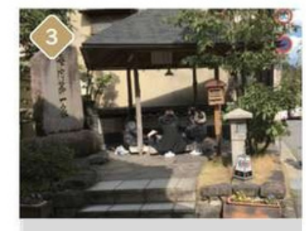
Ichino-yu foot bath 7:00~22:30 There are stairs up to the bath