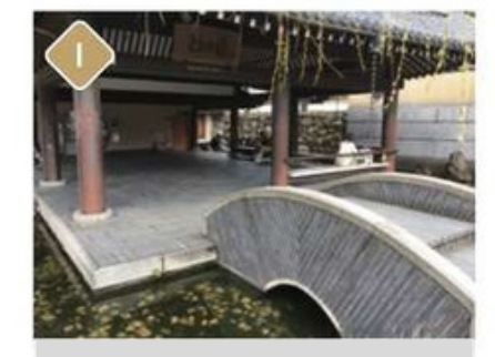
Satono-yu foot bath 7:00~21:00 (Mondays until 18:00) The closest footbath from the station