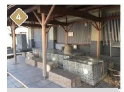
Literature Museum foot and hand bath 9:00~16:30 (weekends and holidays only)