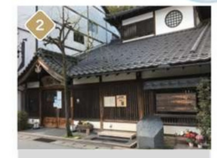
Yanagi-yu foot bath 15:00~23:00 (closed Thursdays)