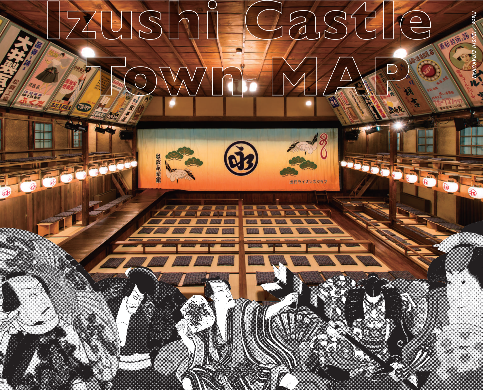
Place / IZUSHI ERAKUKAN