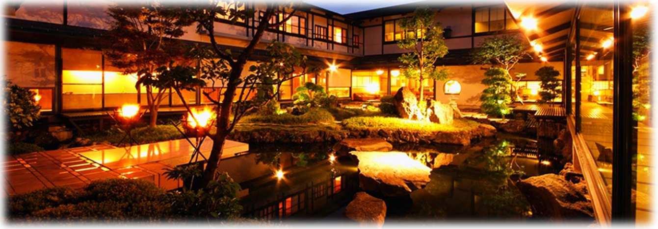
Onishiya Suishoen's garden and Noh stage to the left

As a hot spring town that prides itself with an unchanging cozy atmosphere lasting for over 1,300 years, Kinosaki Onsen has also welcomed various revamps for its traditional ryokan accommodations, further enhancing guests' enjoyment of this ancient and tranquil town. During the COVID-19 pandemic, Kinosaki Onsen took the temporary lack of visitors as an opportunity for some new renovations.