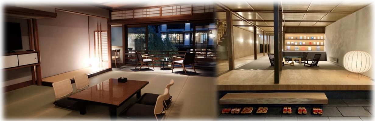
Kobayashiya's renovated guestrooms and lobby

Kobayashiya : A beautiful ryokan with roots in pottery-making, Kobayashiya has re-opened its doors with an all-new cozy lobby area stocked with books from around the world for guests to read, along with sleek private hot spring baths available for guests to reserve during their stay. Those looking for an especially luxurious stay are encouraged to inquire about Kobayashiya's three-room suite overlooking town.