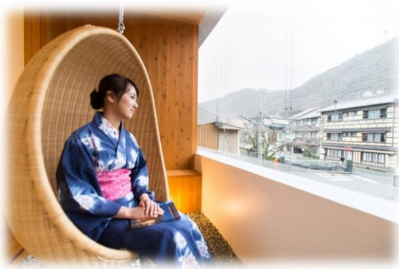
An egg chair in a guestroom

Highly popular among young international travelers, the cafe-hotel hybrid UTSUROI TSUCHIYA ANNEX has begun to offer overnight plans without kaiseki and breakfast meals, but with all of the comforts of a cozy and stylish hideaway in the center of town. In their room, guests can relax in one of UTSUROI's iconic egg chairs, admiring the passersby below before savoring a bite to eat at the downstairs cafe.