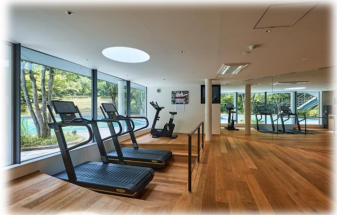
Nishimuraya Hotel Shogetsutei's new gym

Nishimuraya Hotel Shogetsutei : Nishimuraya Honkan's larger, western and Japanese-style counterpart, is widely known as Kinosaki Onsen's premier hotel for group tours as well as international visitors, and has recently added a gym to its long list of amenities. In addition to the elegant lobby lounge, outdoor pool (seasonal), and luxurious Italian restaurant, those specifically looking for an accommodation equipped with a brand-new gym are especially encouraged to consider spending a night at Nishimuraya Hotel Shogetsutei.