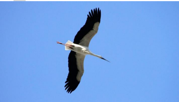
Oriental White Stork