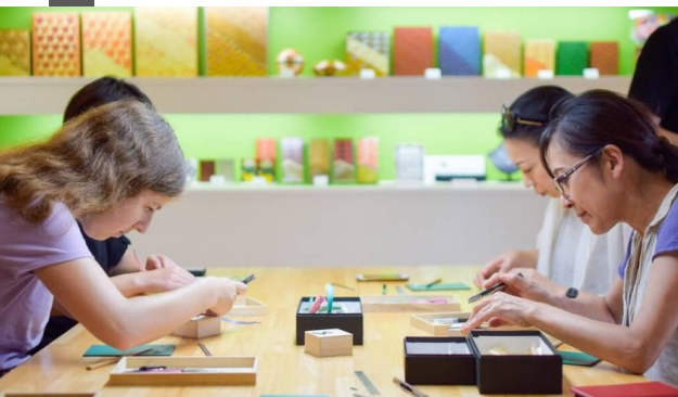
Straw Craft Workshop