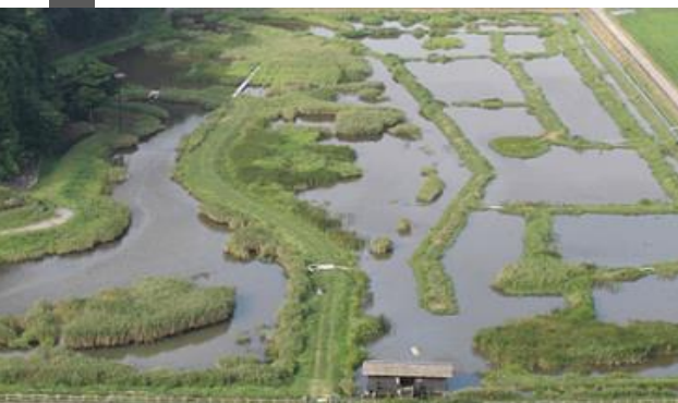
Hachigoro Toshima Wetlands