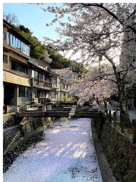
Hana ikada in Kinosaki Onsen

At the end of the season, it is customary to watch the petals fall off the trees, dance in the air, and then float down the canal. A popular phenomenon called hana ikada , meaning “floral raft”, occurs when the clusters of petals resemble a raft floating down a river.