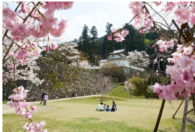
Cherry blossoms add to the blues of the beach in Takeno and to the historic landscapes of Izushi

Visitors to Kinosaki Onsen can enhance their spring sakura-viewing experience by donning a yukata, complimentary with your stay at most ryokan in town . For a wider variety of yukata choices in color and design, guests can also head over to the town’s yukata shop & rental IROHA . Guests may choose from a wide selection of stylish yukata (both women’s and men’s) to rent for the day.