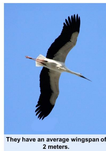
They have an average wingspan of 2 meters.

Commonly known as kounotori in Japanese, the Oriental White Stork once lived in the wild in Japan, until, in 1971, the last stork died in Toyooka City. Part of the reason they disappeared was due to the pesticides that were heavily used in the farmlands of the nation. Toyooka City felt responsible for this tragedy, and thus made a promise to help reintroduce the Oriental White Stork into the wild.