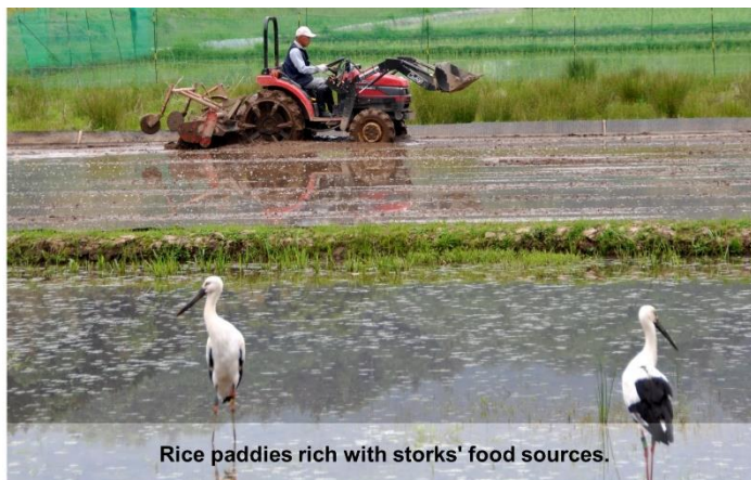
Rice paddies rich with storks' food sources.