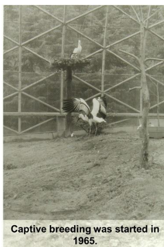
Captive breeding was started in 1965.