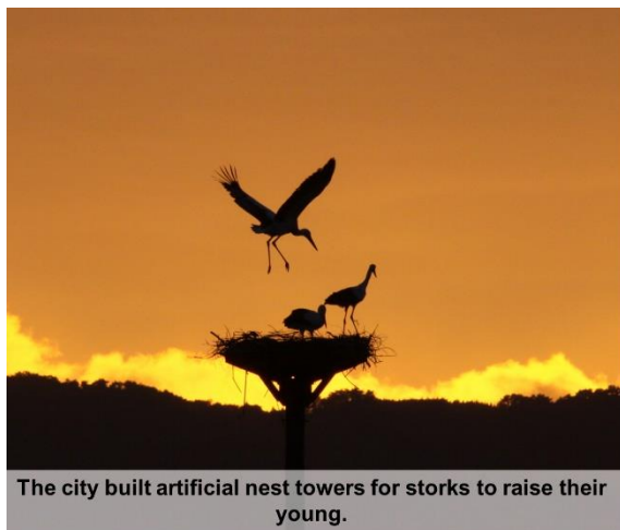
The city built artificial nest towers for storks to raise their young.

Unlike the bustling cities of Tokyo and Osaka, in Kinosaki Onsen and its surrounding areas you can come across various wildlife. From the beach to the mountains to the wetlands, visitors can spot various birds, fish, and other creatures coexisting with the locals. One of these is a beloved symbol of Toyooka City, the Oriental White Stork. These birds tell the story of Toyooka's promise to reintroduce them back into the wild.