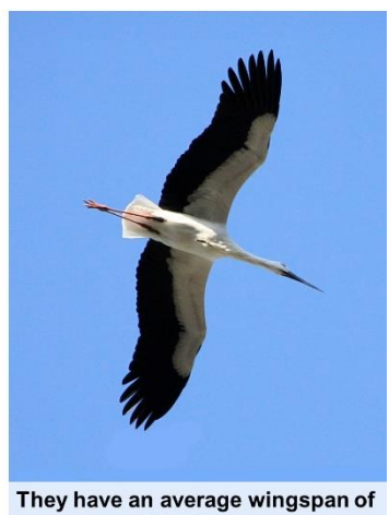
Commonly known as kounotori in Japanese, the Oriental White Stork once lived in the wild in Japan, until, in 1971, the last stork died in Toyooka City. Part of the reason they disappeared was due to the pesticides that were heavily used in the farmlands of the nation. Toyooka City felt responsible for this

Soon, a breeding and research facility was created to begin breeding and raising them in captivity. However, chicks could not hatch for many years due to the adult storks' chemically damaged bodies. Although discouraged, Toyooka City never gave up. Thanks to a donation of six young storks from Russia, the city was able to continue their efforts. In 1989, a miracle occurred when the Oriental White Storks produced a healthy chick, achieving successful breeding for the first time. Chicks have